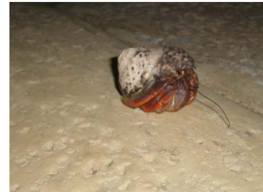
Hermit crabs do not have their own shell so find and live in an empty one This one was crawling along a path at the hotel. Coco decided against featuring in this photograph