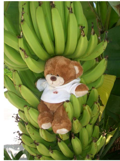
These lovely bananas are growing all around the hotel