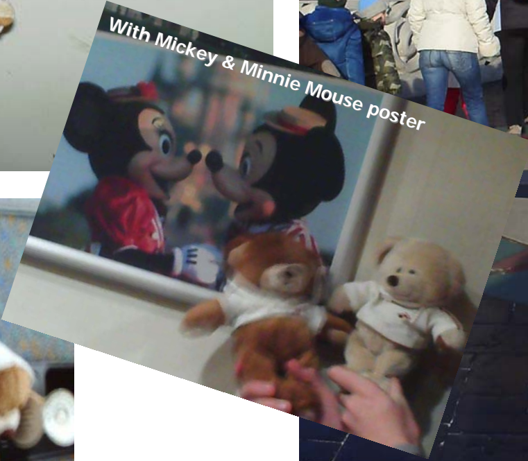
With Mickey & Minnie Mouse poster