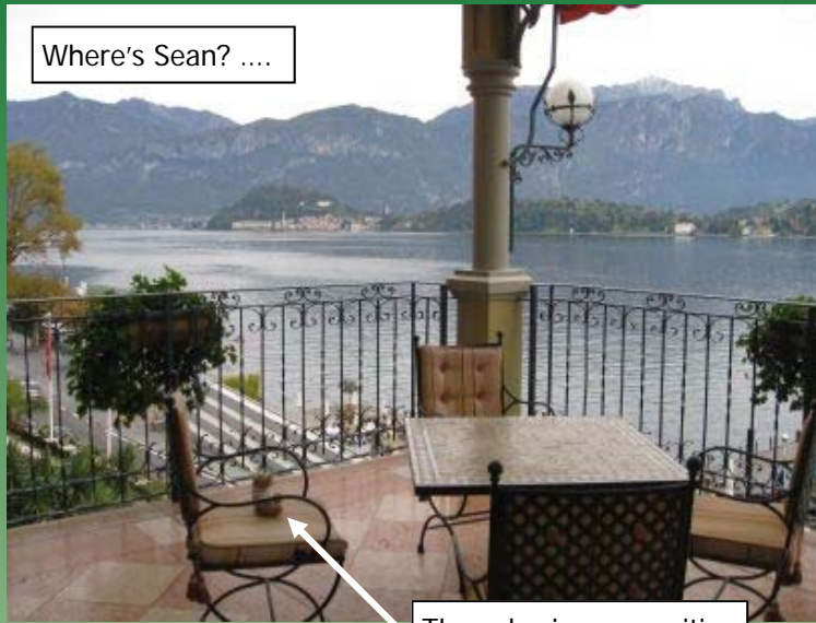
There he is . . . waiting patiently for food again!