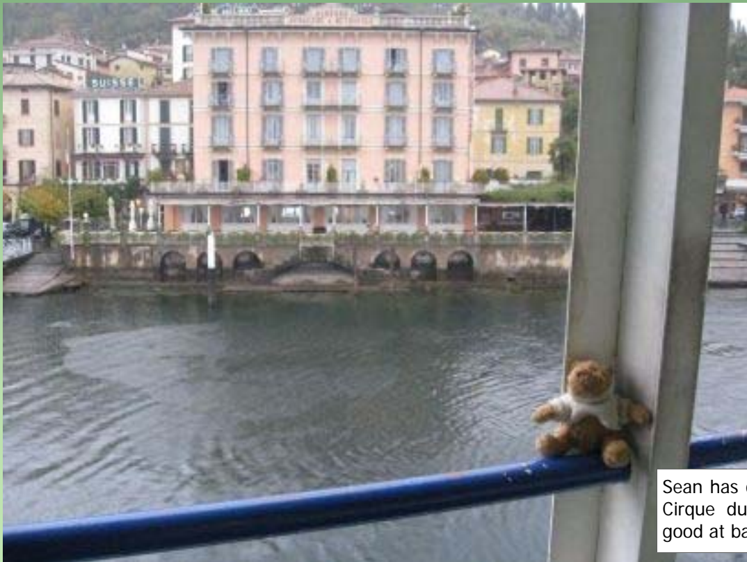
Sean has decided that perhaps he'll join Cirque du Soleil as he's become very good at balancing and hasn't fallen...yet!