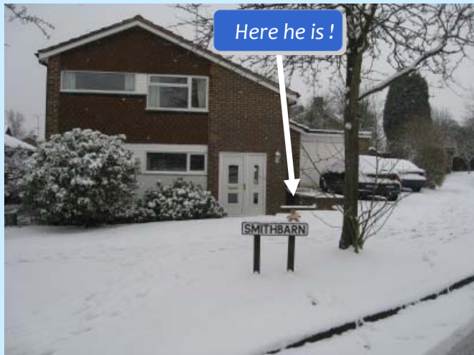
Here he is!