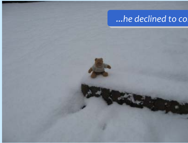
...he declined to comment on his lower regions!!