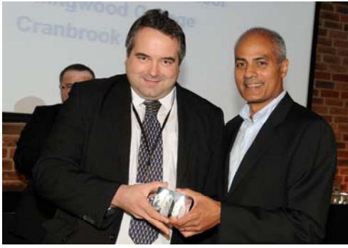
ISA Presentation 8 Oct 08 receiving award from George Aligiah