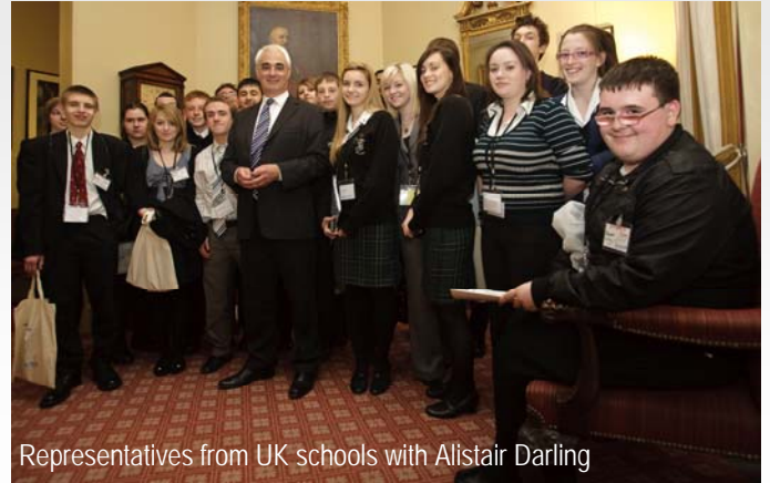
Representatives from UK schools with Alistair Darling