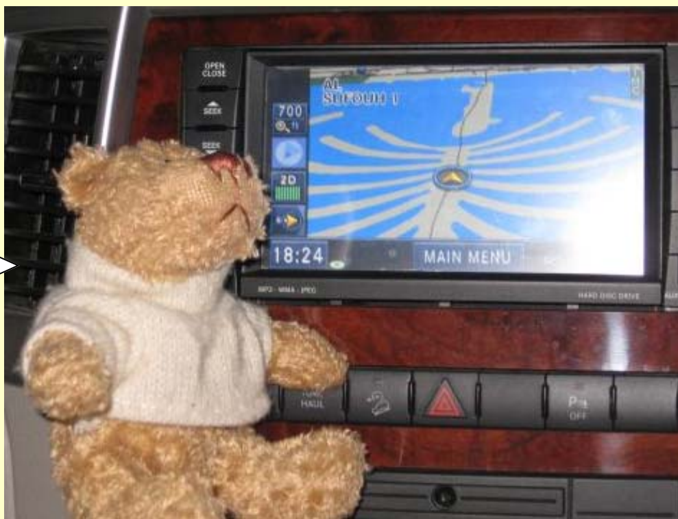
Dubai's infamous Palm Island as seen on Sat Nav!