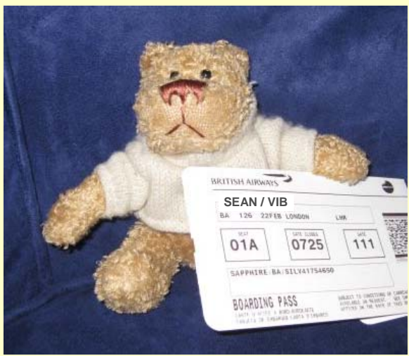
Sean chooses to travel First Class for the extra legroom, he's been allocated seat 1A due to his VIB status—Very Important Bear