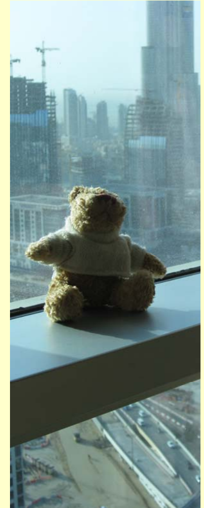
The views from the hotel were amazing, Sean felt insignificant compared to the immense skyscrapers being built, particularly. . . .