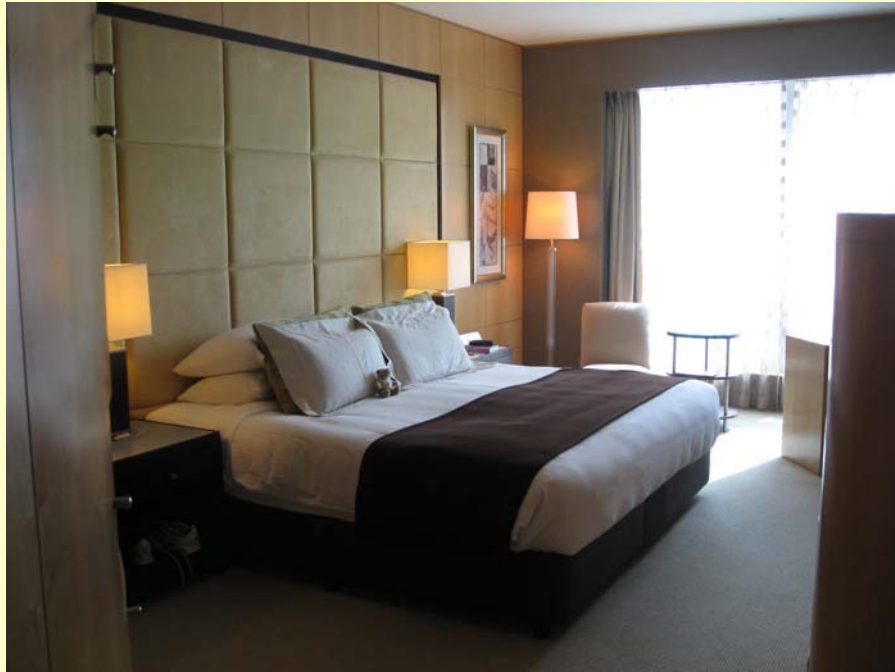
Sean enjoyed the luxury of his room, particularly the mini bar but was concerned the 8 pillows might not be enough!