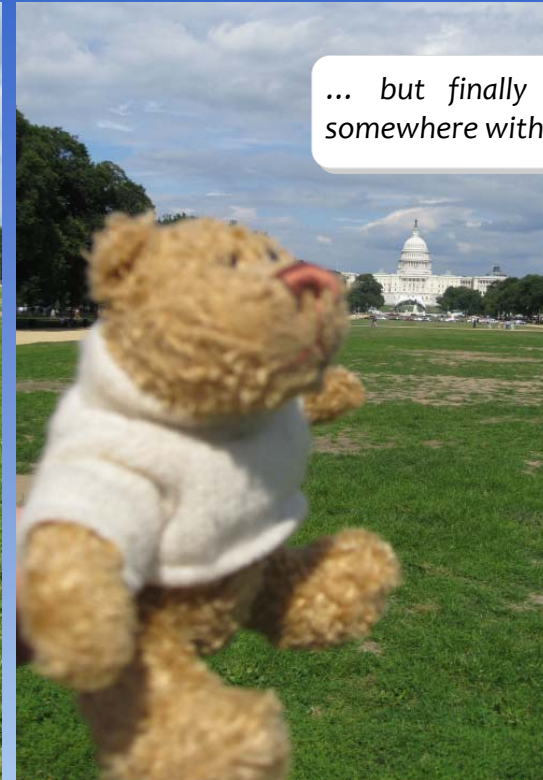
... but finally managed to find somewhere with a nice view!

Washington has a humid subtropical climate. Blizzards affect Washington on average once every four to six years. The most violent storms are called "north easters", which typically feature high winds, heavy rains, and occasional snow. These storms often affect large sections of the U.S. East Coast.