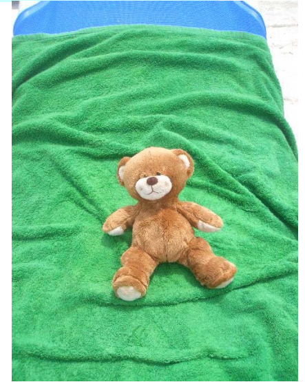
32° is too hot to be wearing a hoody