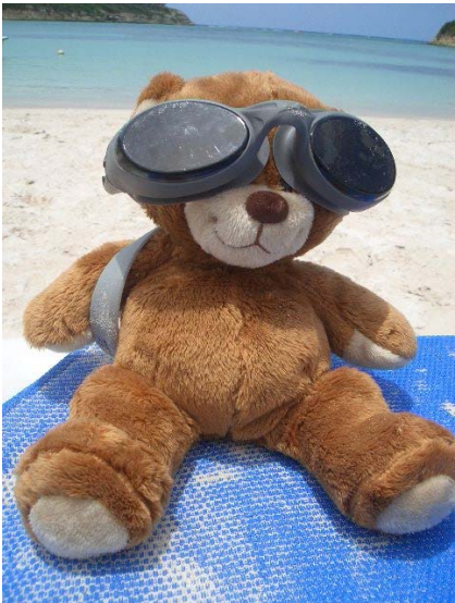
Anyone for a swim?