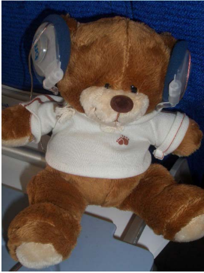
Ready for the 8 hour BMI flight