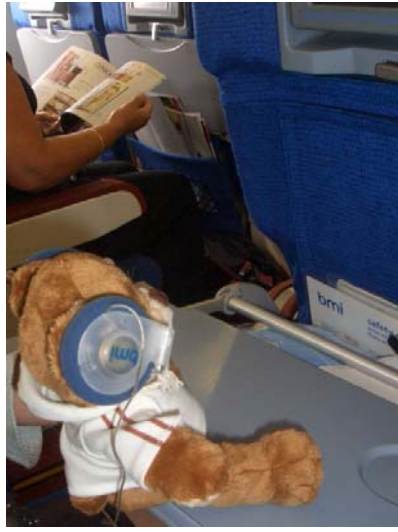
These headphones fit perfectly