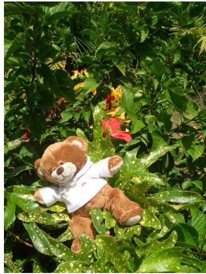
Lovely flowers here!