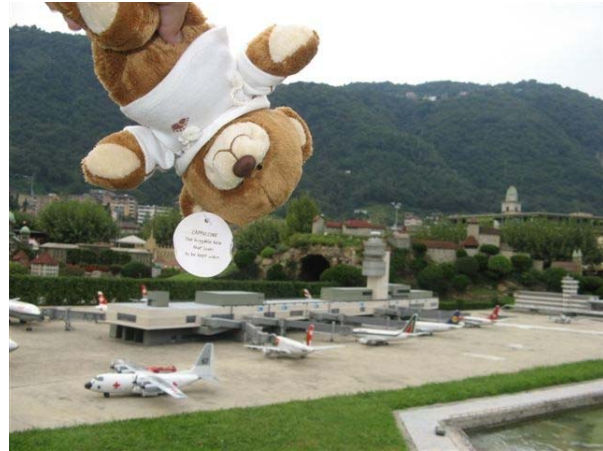
Flying the flag at mini Zurich airport