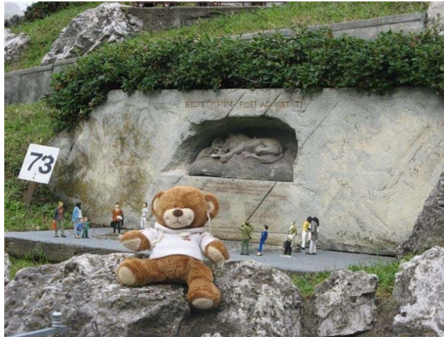
A small time in Lourdes