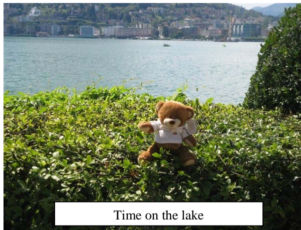
Time on the lake