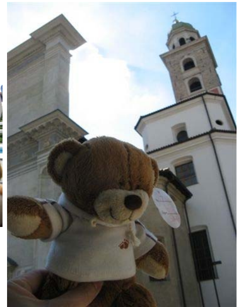
Ssh! It's a cathedral.