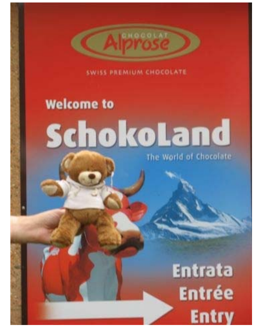
Can I live here?