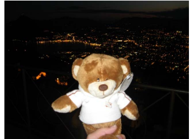
Night time view