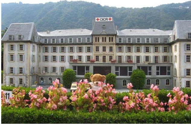
Red Cross—pocket size!