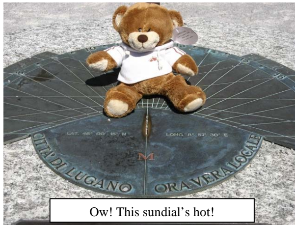
Ow! This sundial's hot!