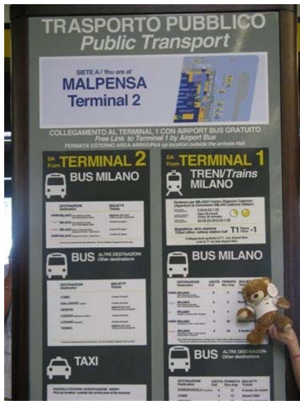
What bus are we taking?